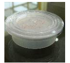
Easy to Incubate