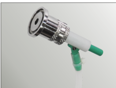
Single 'Vessel Port' connections with single as well as Multiple Sampling Ports