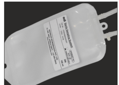
Specially designed multilayered bag film