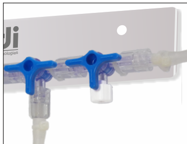
Single cut off Safety Valve: Cuts off the entire Sampling system in case of any eventuality