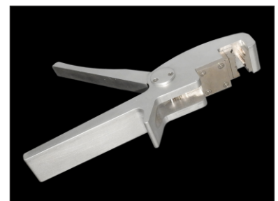
Crimping and Cutting Tool