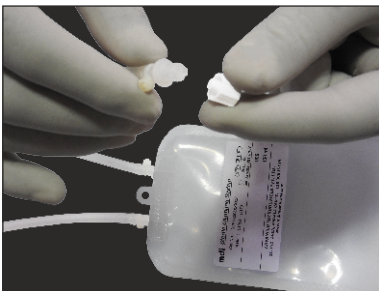
Female luer ports with male luer cap on outlet tubing on each sampling bag for easy drawing of samples